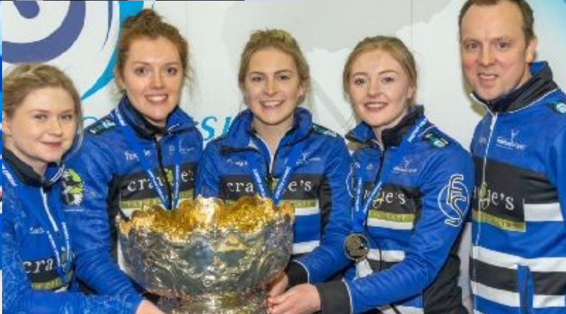
Olympic Success in 2014 with a silver in mens play and a bronze in womens