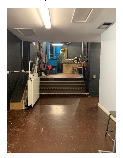
Mains Power 63A 3Ph and view of the bars